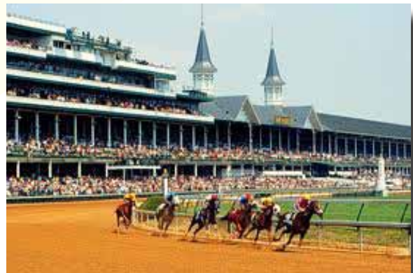
Churchill Downs, Louisville

Please call for a reservation form. Deposit of $100 must accompany your registration. Activity level 5. RSVP by May 10.